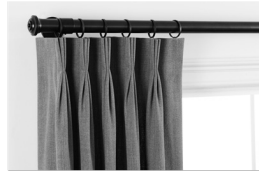
3-FINGER PINCH PLEAT