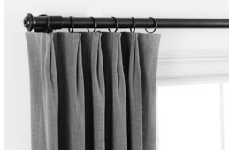
2-FINGER EURO PLEAT