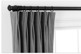
2-FINGER PINCH PLEAT